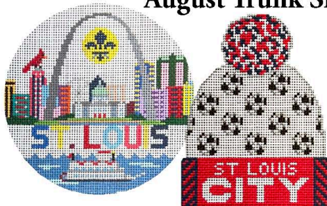
Lauren Bloch Designs

Always - 20% off all trunk show canvases, including special orders!