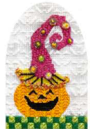
McHappy Pumpkin Class October 17th, 2024