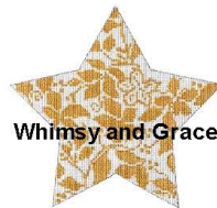
Whimsy and Grace